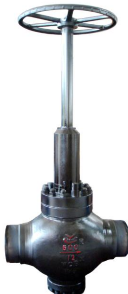
UNDERGROUND THROTTLE GLOBE VENT VALVE