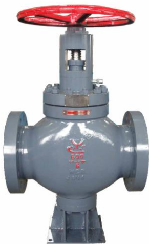
MANUAL VENT VALVE