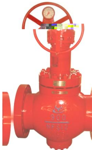
BEVEL GEARED VENT VALVE