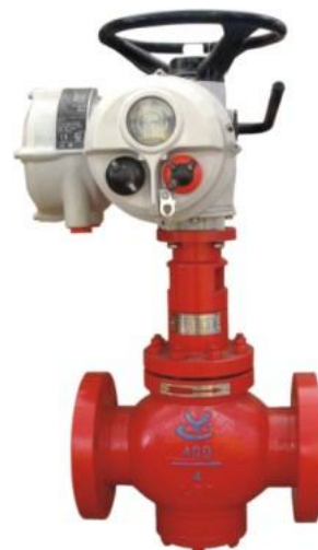
ELECTRICAL VENT VALVE